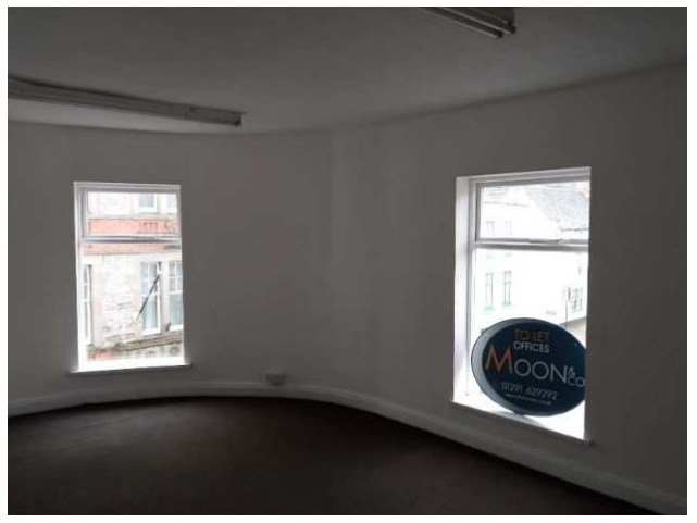
High Street Survey